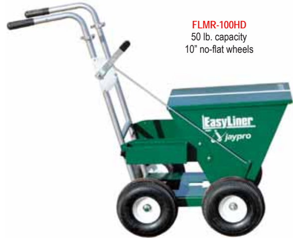
FLMR-100HD 50 lb. capacity 10" no-flat wheels