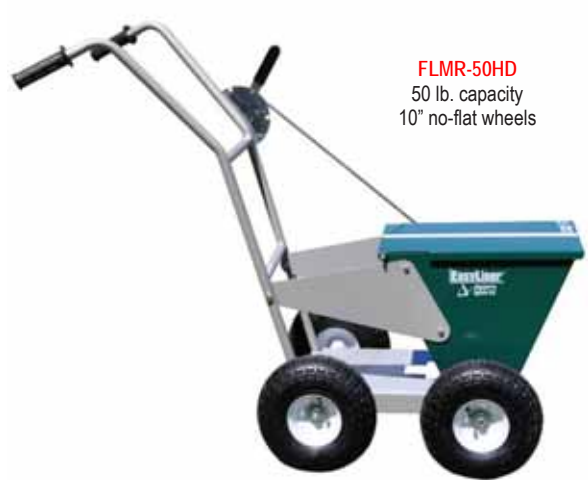
FLMR-50HD 50 lb. capacity 10" no-flat wheels