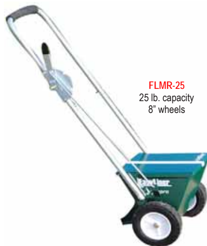
FLMR-25 25 lb. capacity 8" wheels