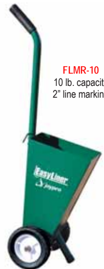
FLMR-10 10 lb. capacity 2" line marking