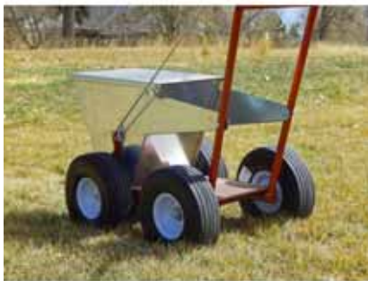
#10001744 NewLiner 50lb HD 4-Wheel #10001745 NewLiner 100lb HD 4-Wheel