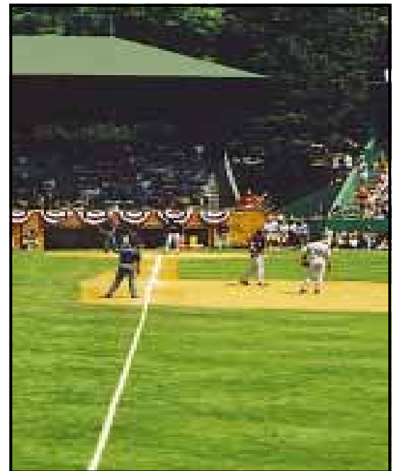
Installed at Doubleday Field in Cooperstown, NY — Baseball's most traditional